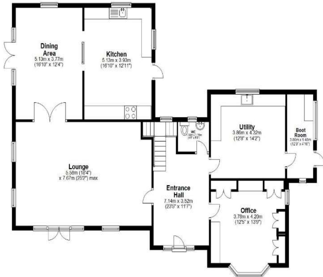
First Floor Approx. 126.5 sq. metres (1361.8 sq. feet)